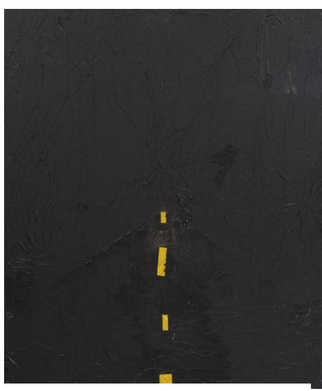
Untitled, Brenna Youngblood, Mixed media on canvas, 2015.