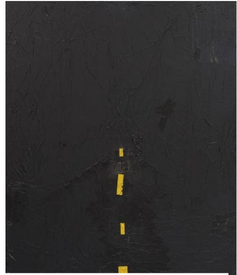
Untitled , Brenna Youngblood, Mixed media on canvas, 2015.